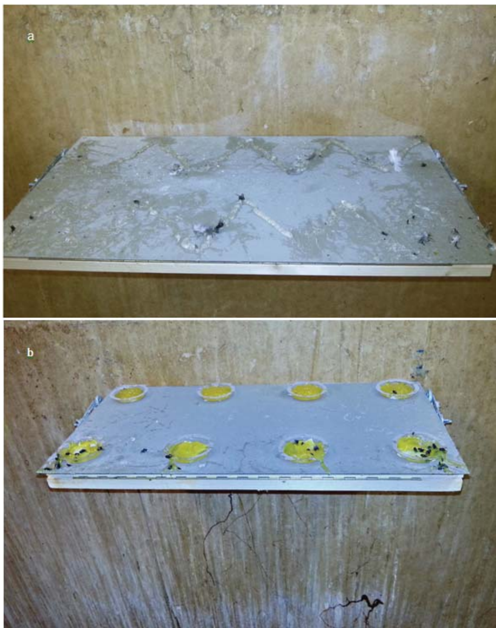
Figure 3. Appearance of the tactile gel (a) and the optical gel (b) after 23 days of application. Due to the adhesive effect numerous insects, feathers, dust and feces became stuck in the gels. The gluey optical gel got stuck on the wall underneath the experimental shelf when the pigeons stepped into the repellent and flew off pulling long adhesive strings. These remains were extremely difficult to remove.

As to the animal welfare point of view we could observe several pigeons stepping into the gels, either directly when landing onto the experimental shelves or subsequently after landing next to the shelves. Already after a short period of time, both gels looked rather unesthetic and messy due to a variety of insects, feathers and dirt that become stuck in the repellents either directly or in the remains on the shelves (Figure 3).